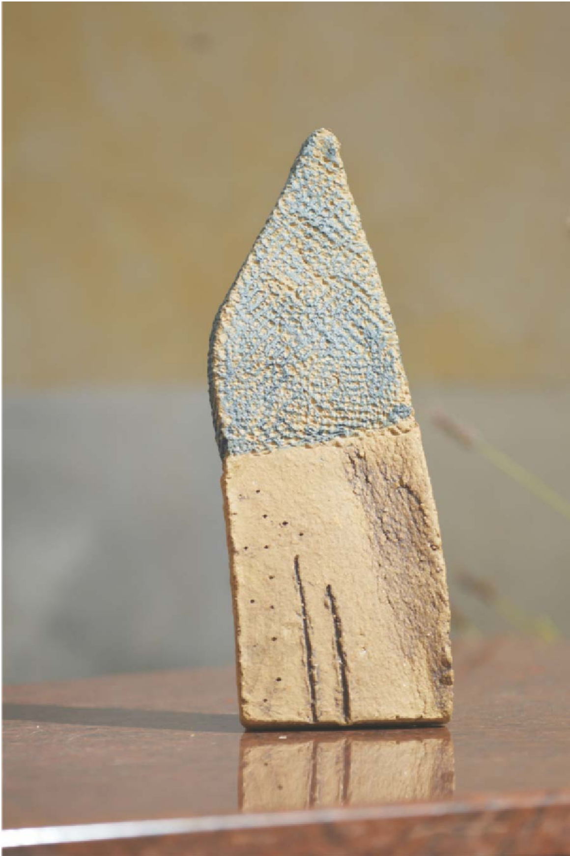
Ceramic stoneware - 2014