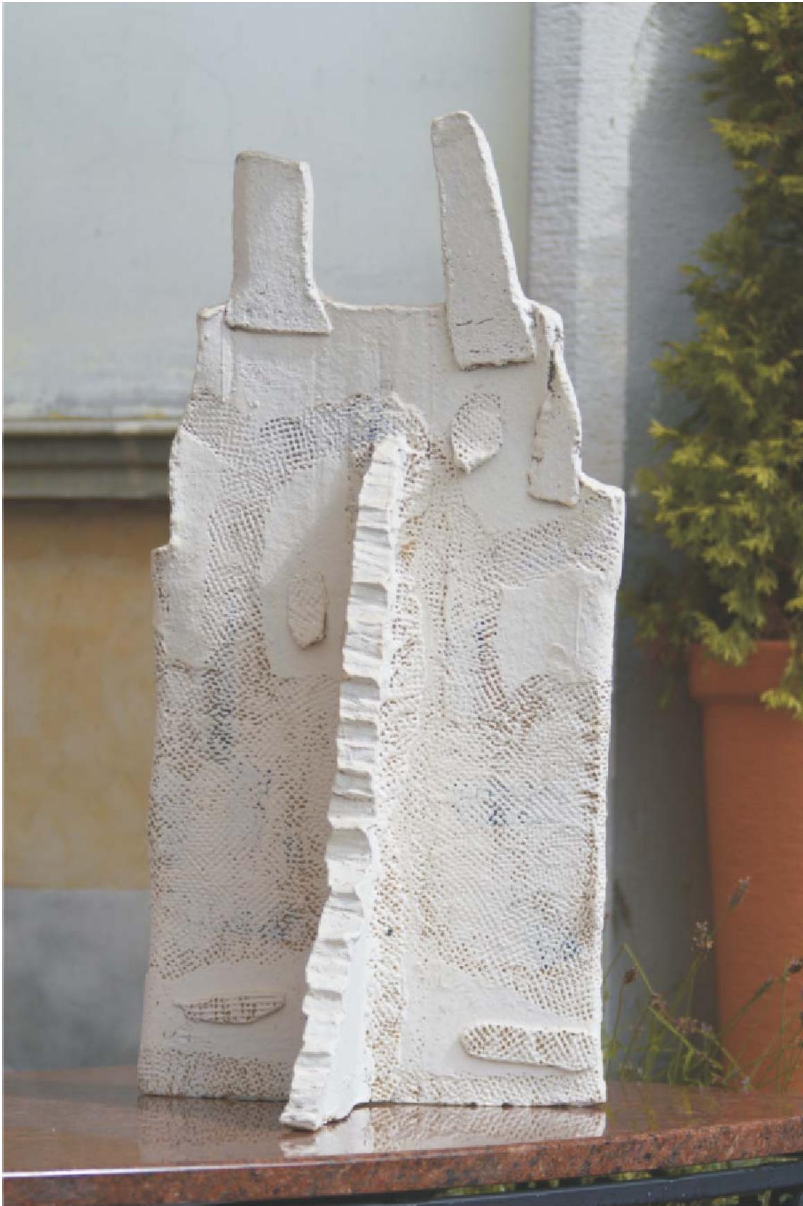
Ceramic stoneware - 2014