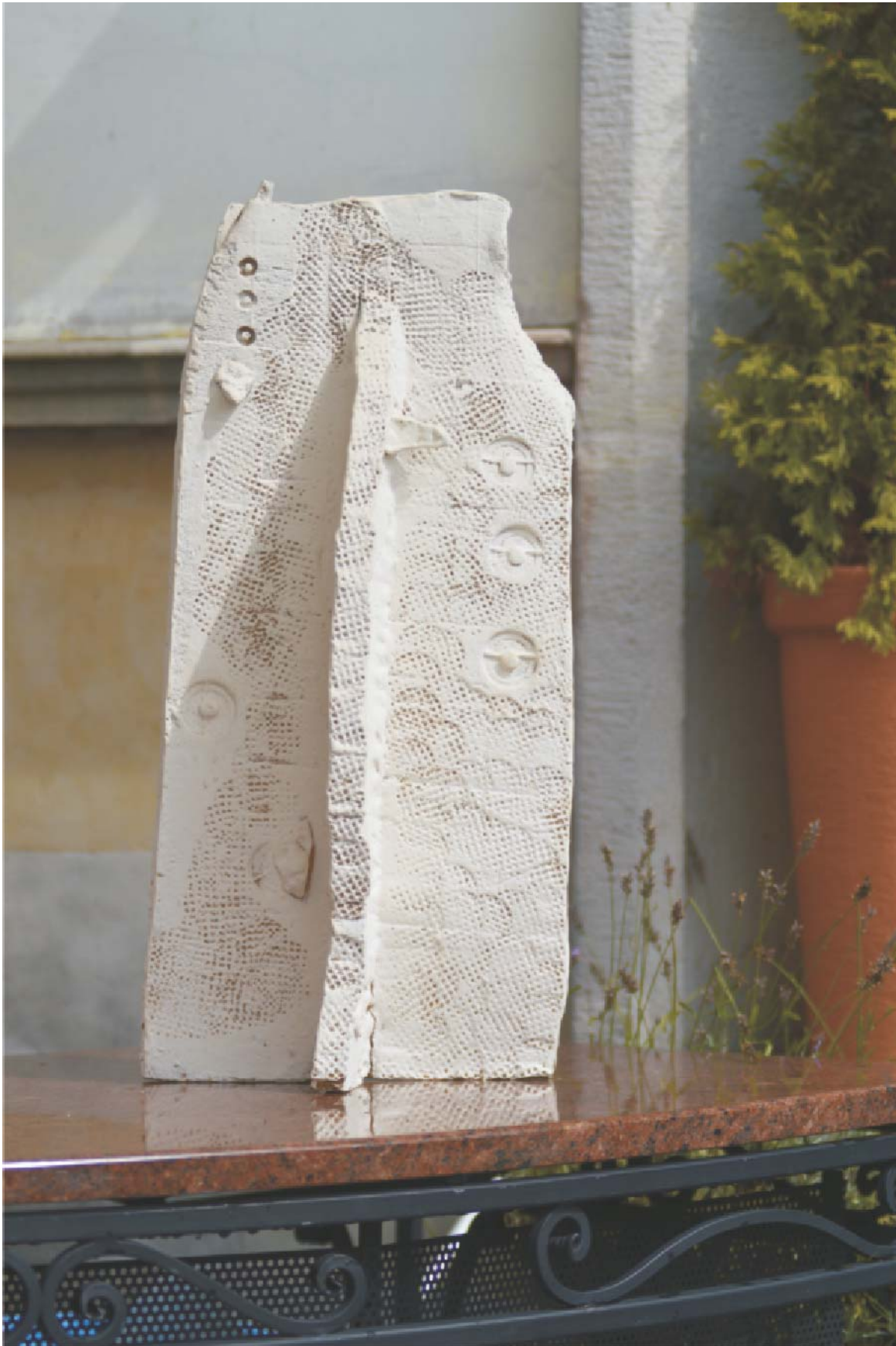
Ceramic stoneware - 2014