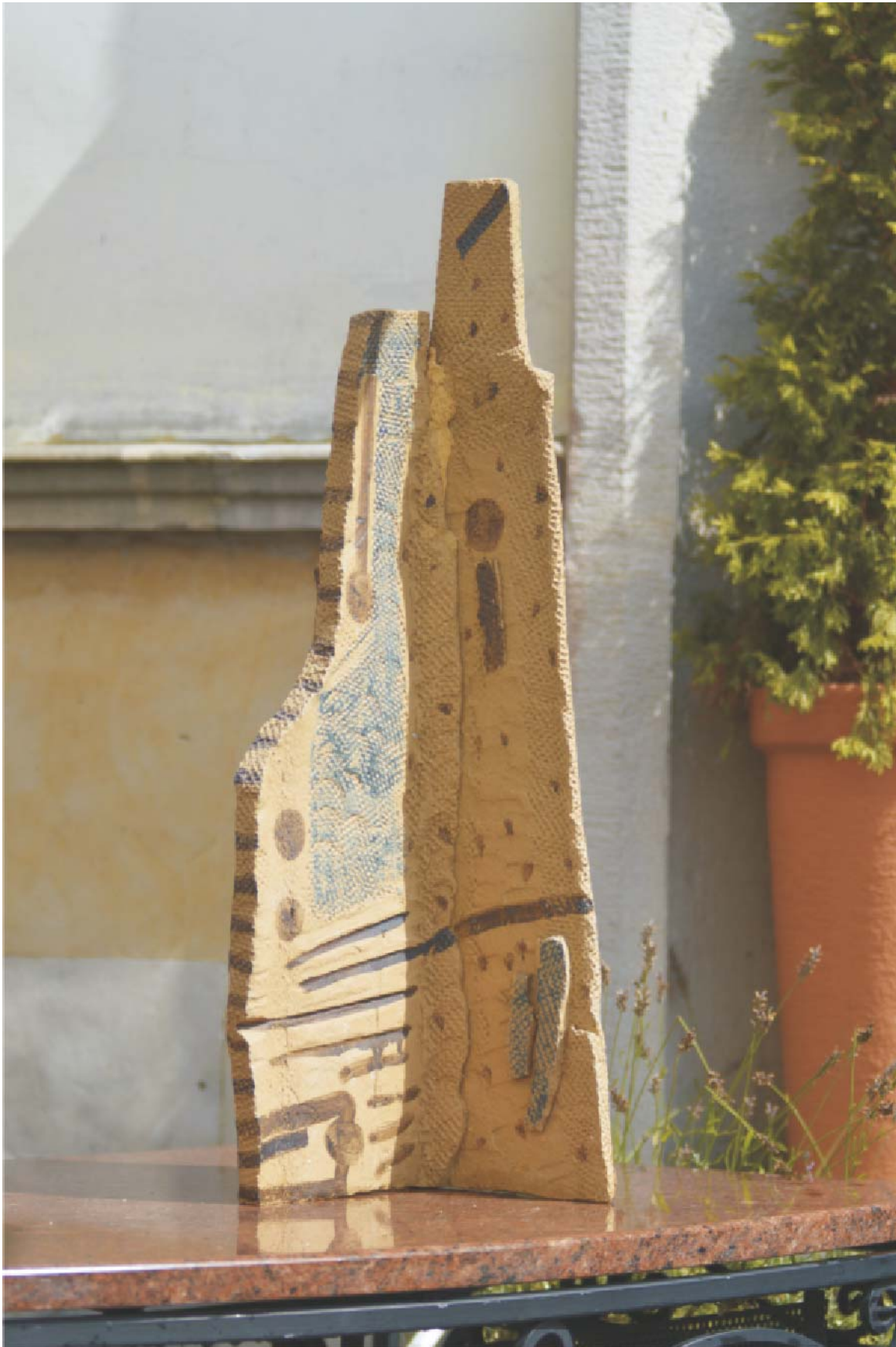
Ceramic stoneware - 2014