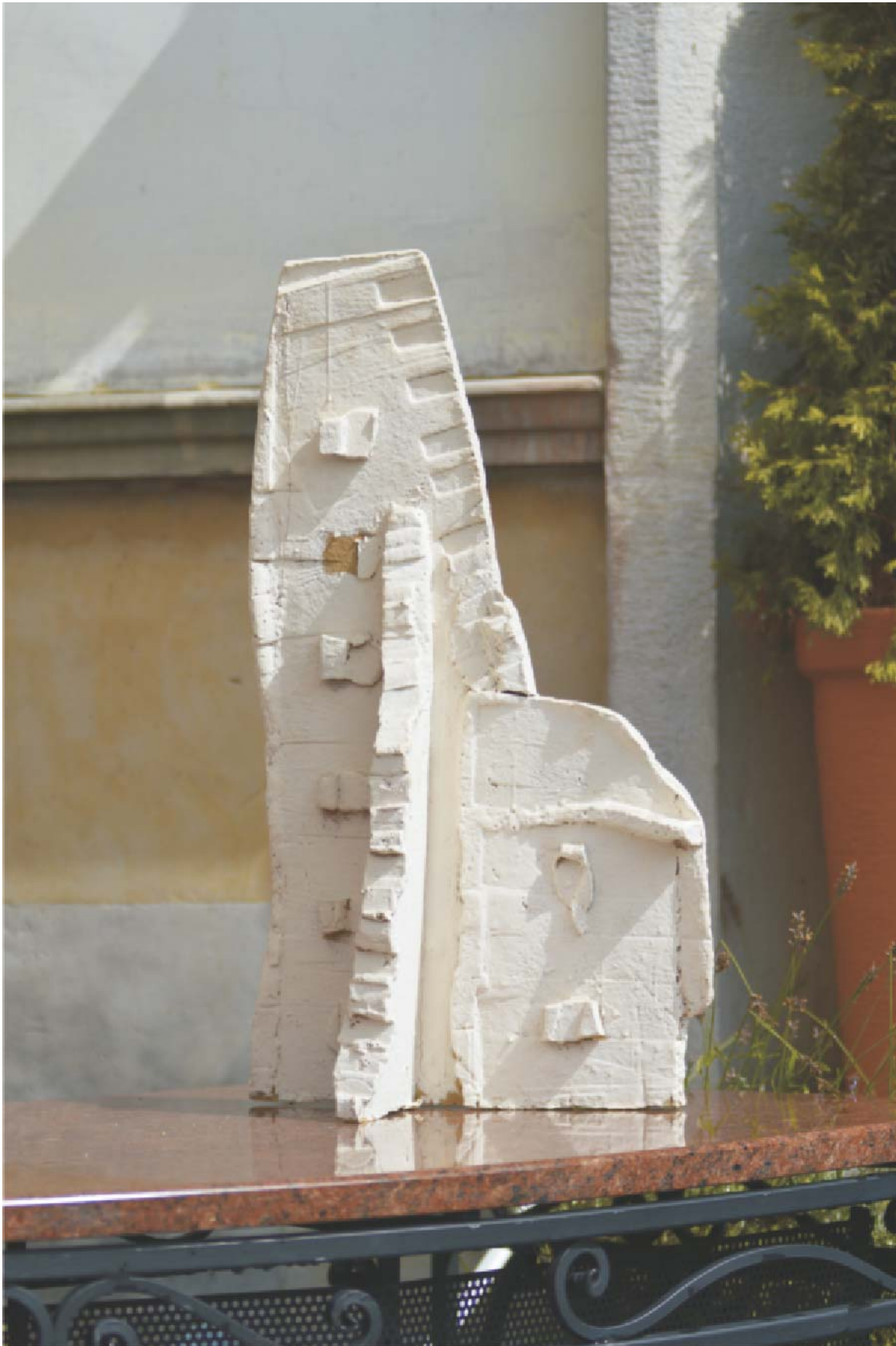
Ceramic stoneware - 2014