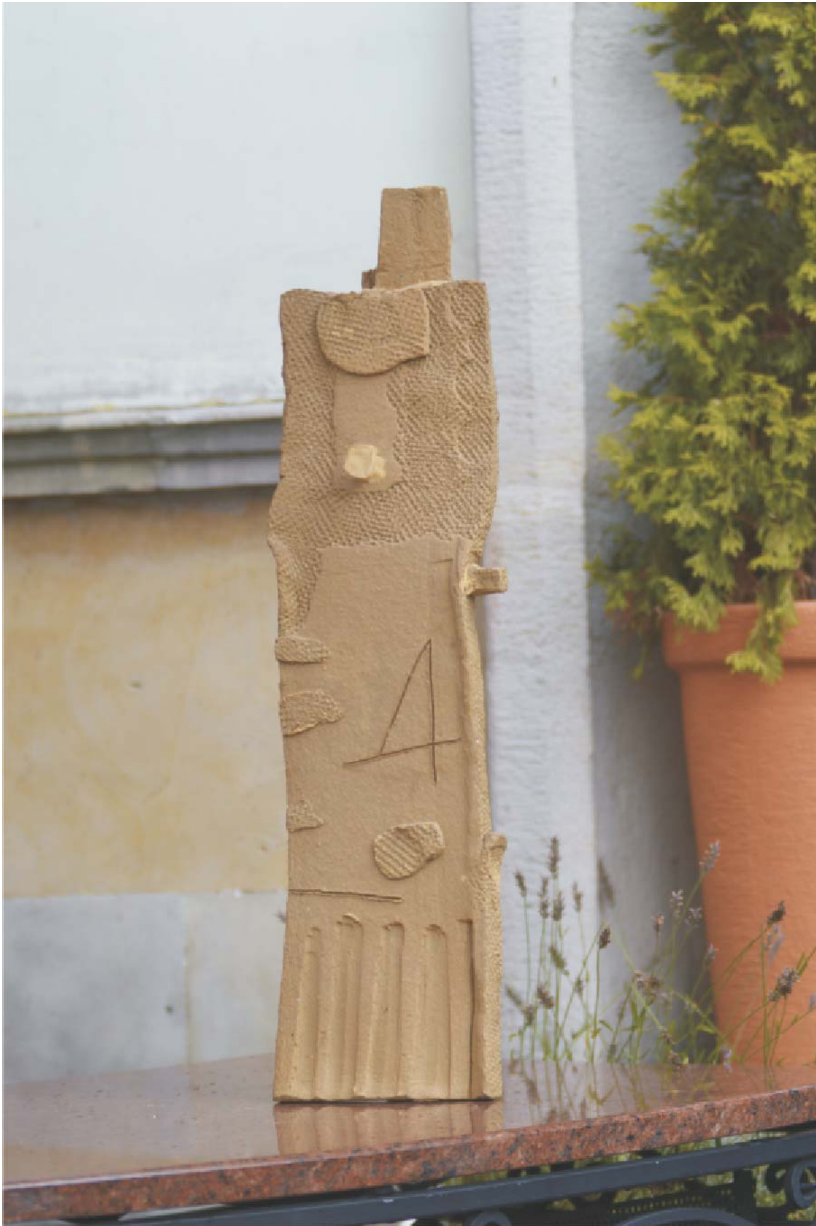
Ceramic stoneware - 2014