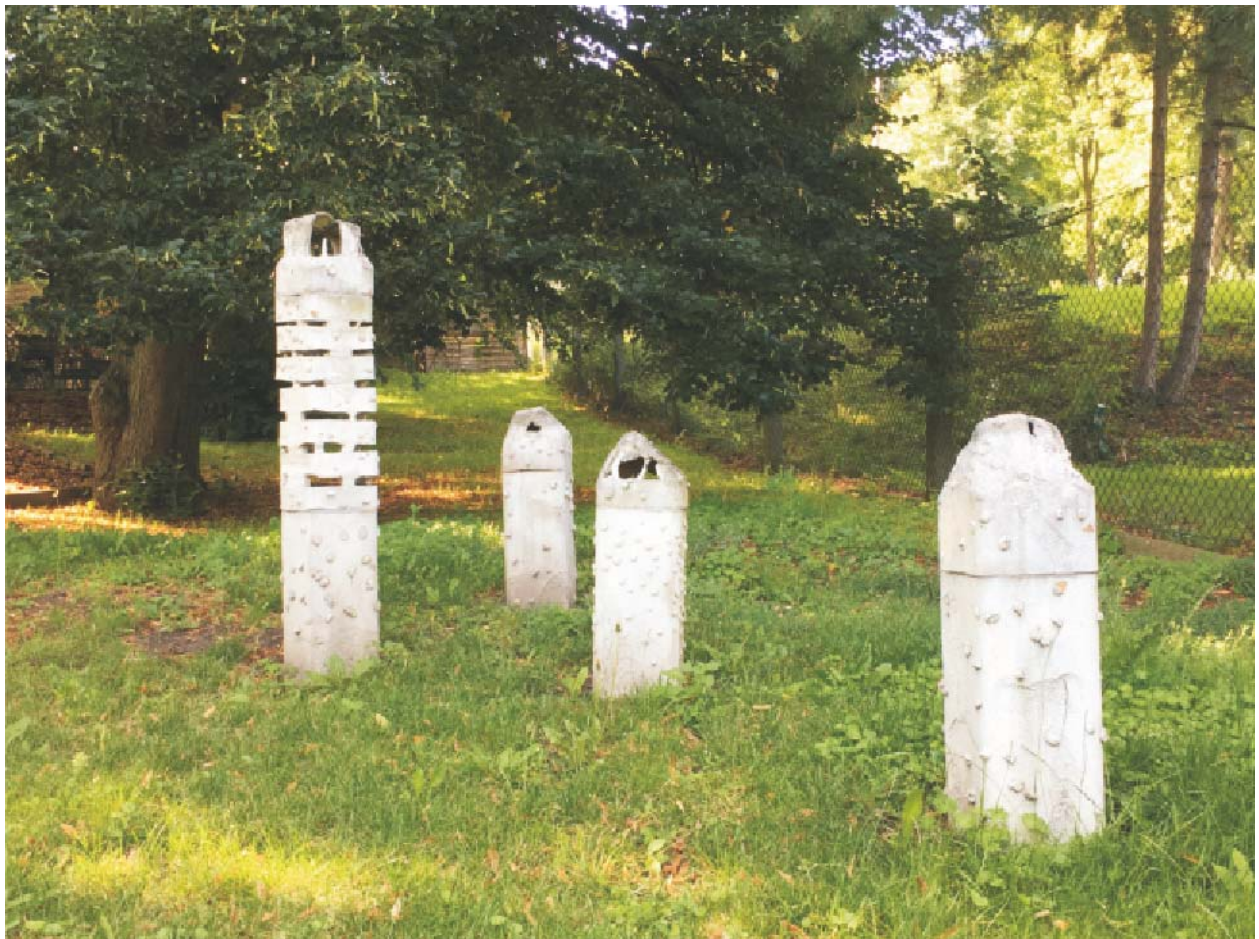
Ceramic stoneware - 2014