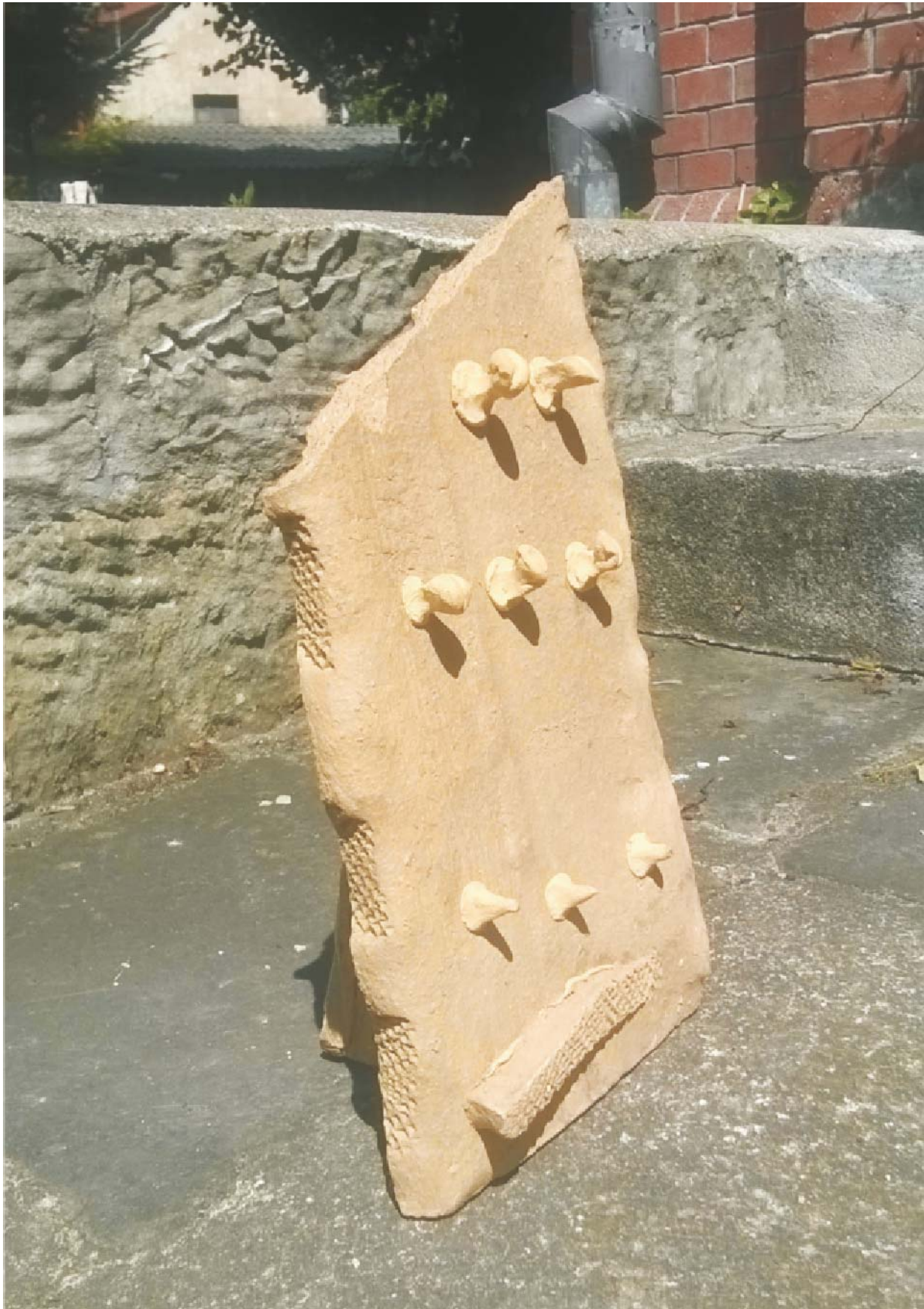
Ceramic stoneware - 2014