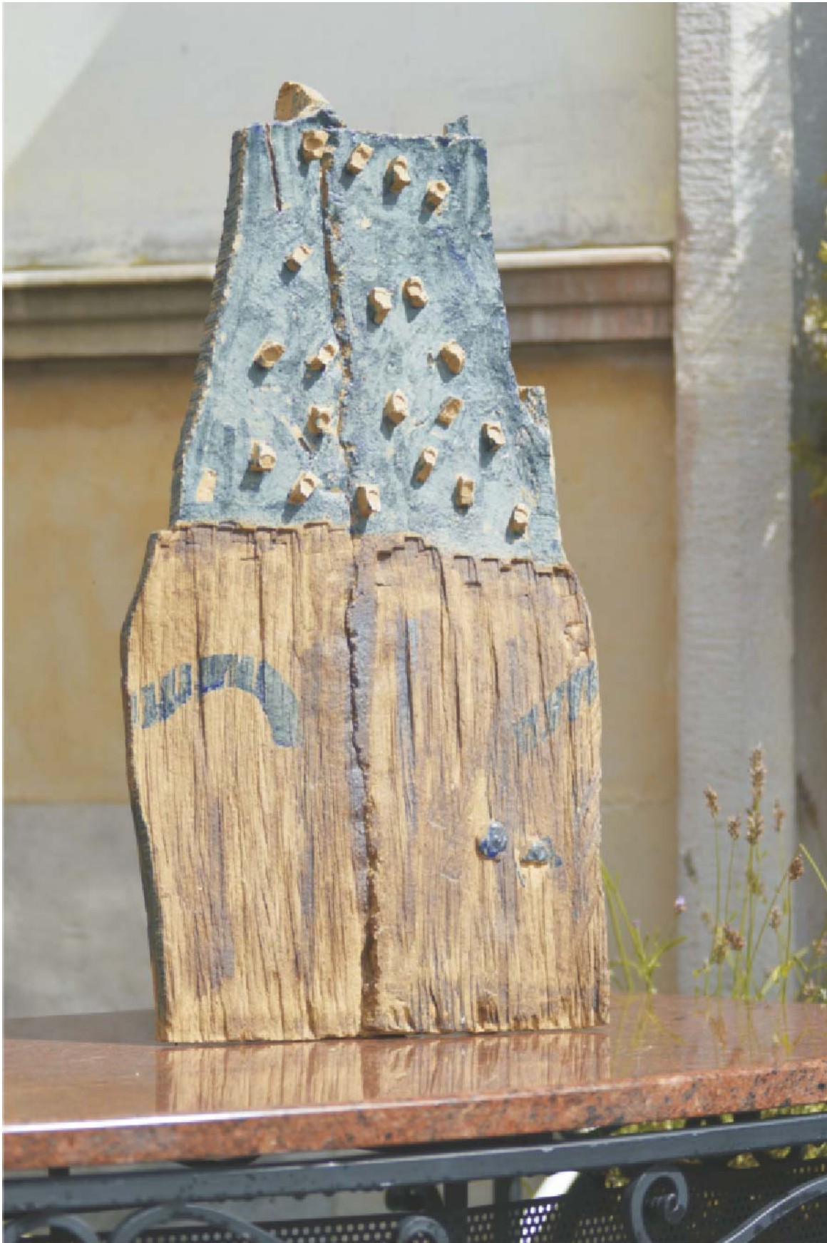
Ceramic stoneware - 2014