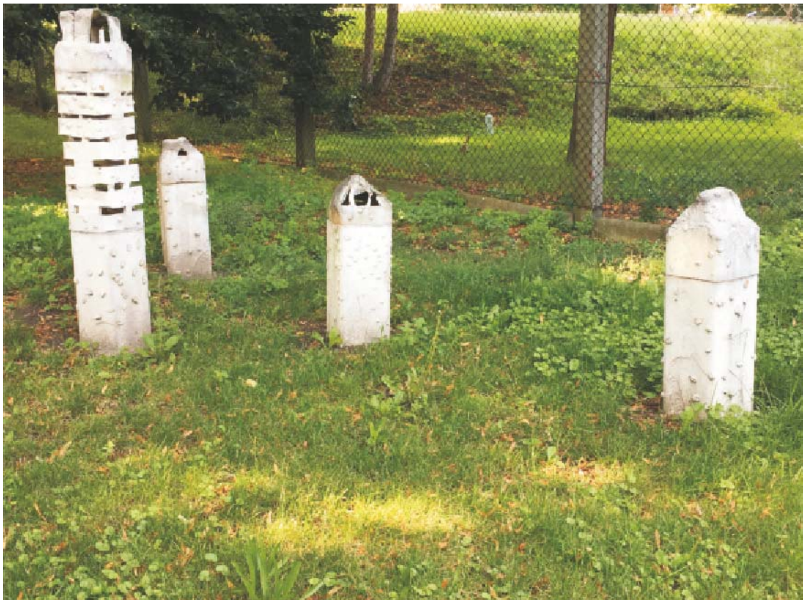
Ceramic stoneware - 2014