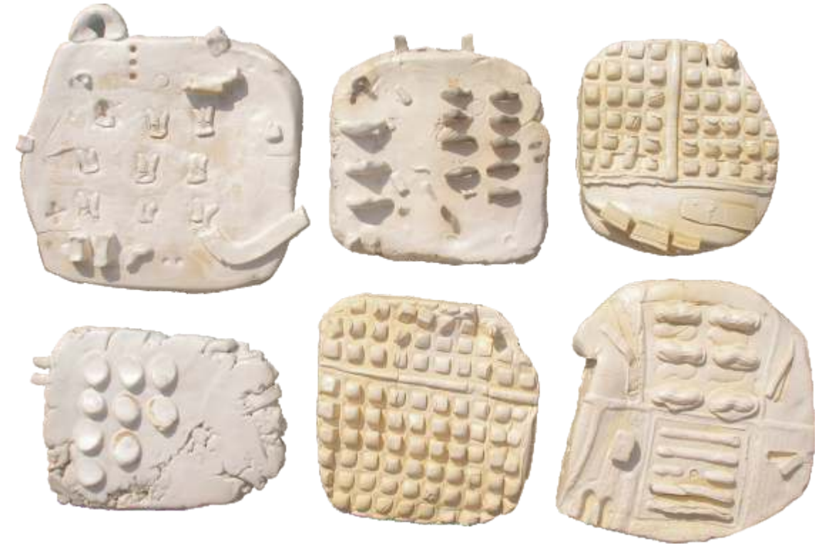
JAPANESE STONEWARE ELECTRIC KILN FIRED AT 1230°C | SIZE 60 X 36 INCHES