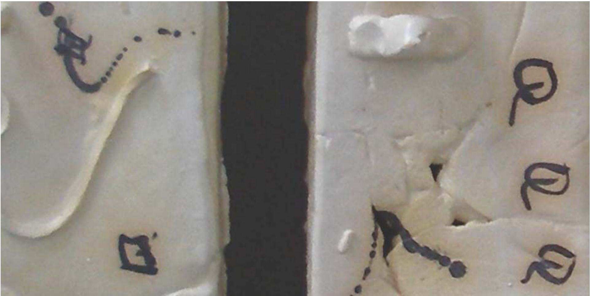
JAPANESE STONEWARE ELECTRIC KILN FIRED AT 1230°C | SIZE : 60 X 40 INCHES