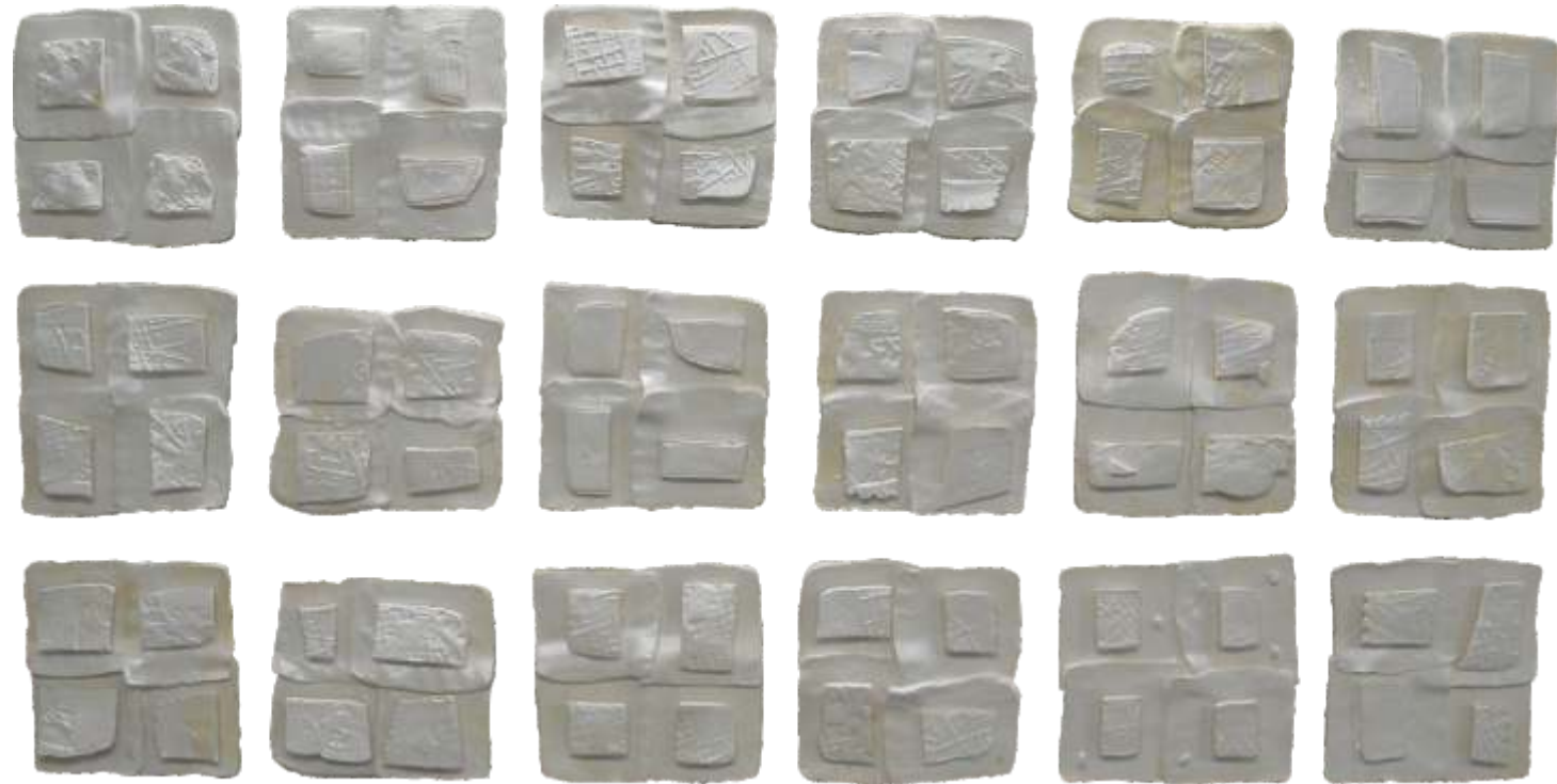
JAPANESE STONEWARE ELECTRIC KILN FIRED AT 1230°C | SIZE 72 X 36 INCHES