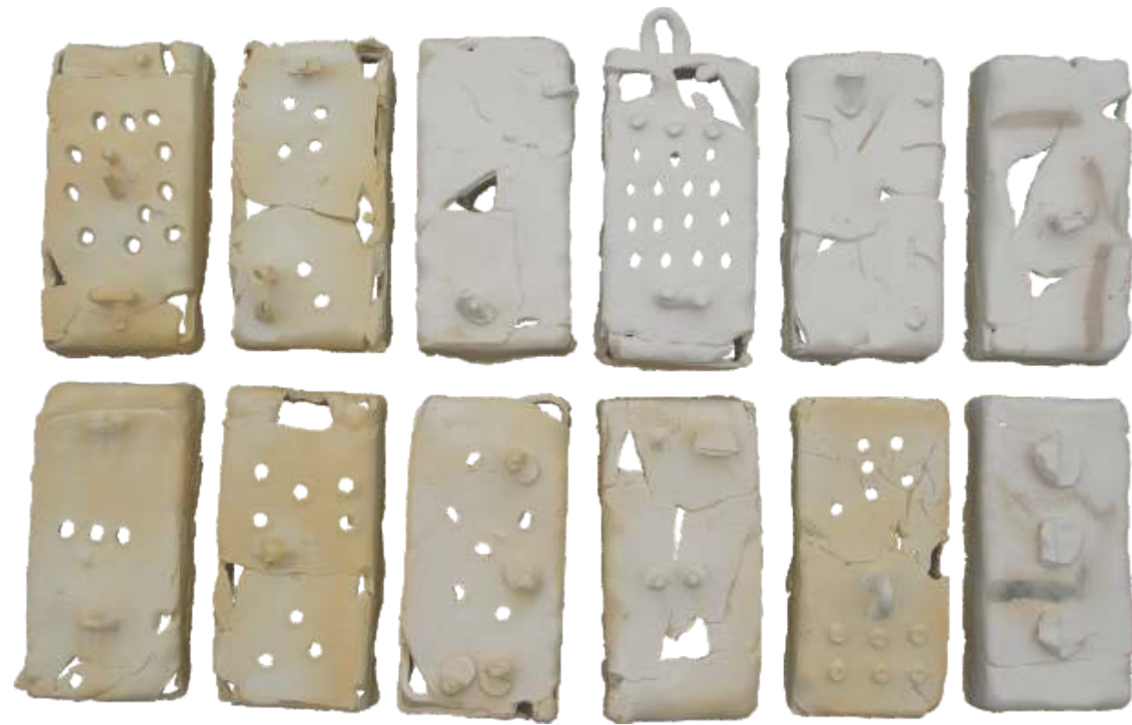
JAPANESE STONEWARE ELECTRIC KILN FIRED AT 1230°C | SIZE : 60 X 40 INCHES